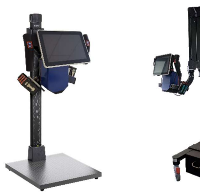
Mounted on a standard camera stand or rolling articulated camera arm stand